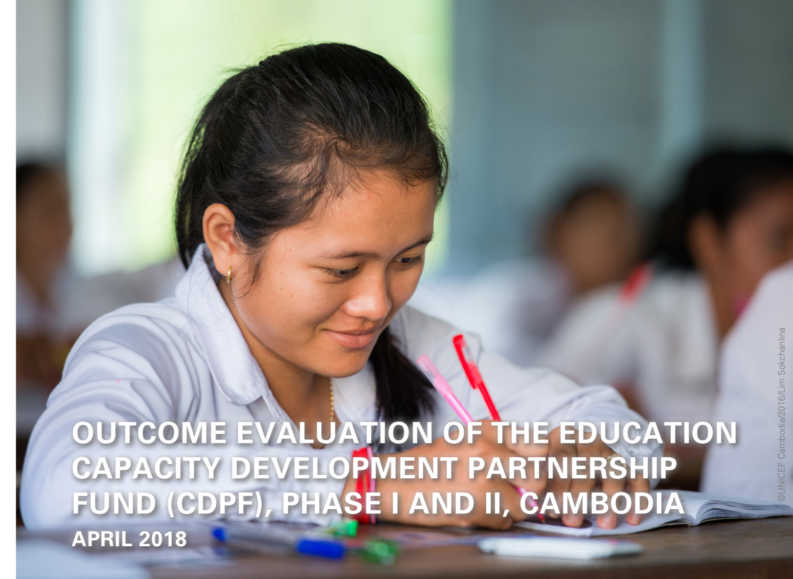
OUTCOME EVALUATION OF THE EDUCATION CAPACITY DEVELOPMENT PARTNERSHIP FUND (CDPF), PHASE I AND II, CAMBODIA APRIL 2018